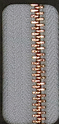
亮红铜 Shiny Bright Copper