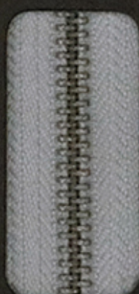
浅克镍 Antique Silver