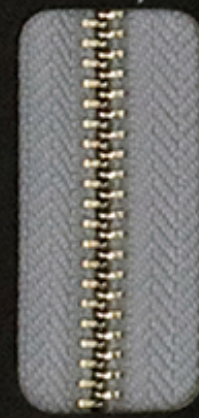
浅金 Bright Gold