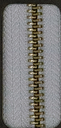
青古铜 Antique Brass