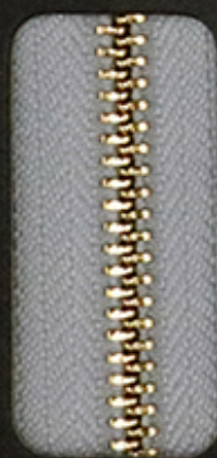
浅茶金 Light Brown Gold