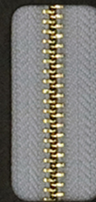
亮金 Shiny Golden Brass