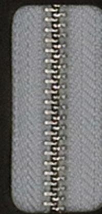
亮银 Shiny Silver