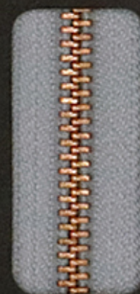
红铜 Bright Copper