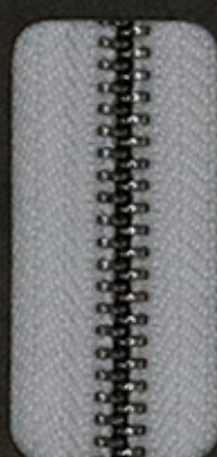
黑镍 Black Nickel