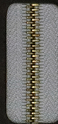
欧款牙 Viaduc Teeth