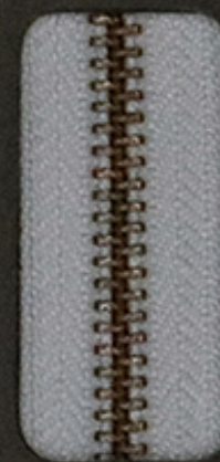
红古铜 Antique Copper