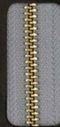
Y牙 Y Teeth