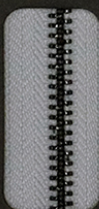
黑珍珠 Black Pearl 仅允许选择配黑色布带 Black Tape Only