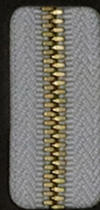
玉米牙 Corn Teeth