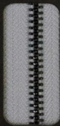
亮黑镍 Shiny Black Nickel